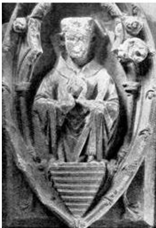
Aymer's memorial in Winchester Cathedral

And a final local connection with Pembroke? The current Earls of Pembroke no longer have any links to Pembroke Castle, their 'seat' now being Wilton House near Salisbury.