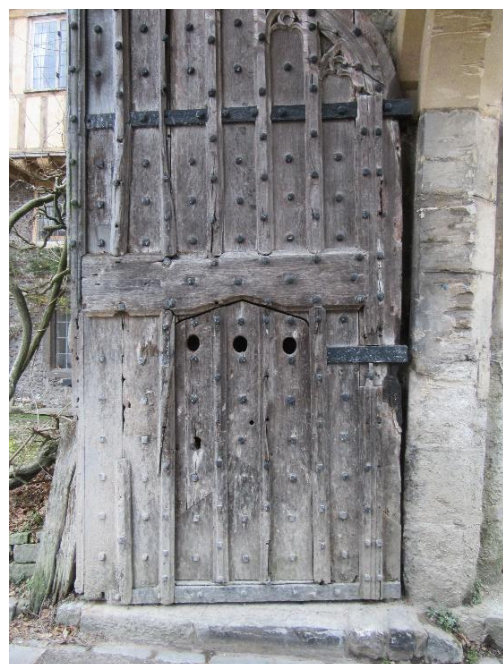
Priors Gate Winchester Cathedral Close