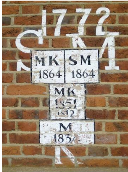
Parish Boundary Marker on Back Wall of #3 The Square