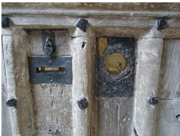
Winchester College Middle Gate