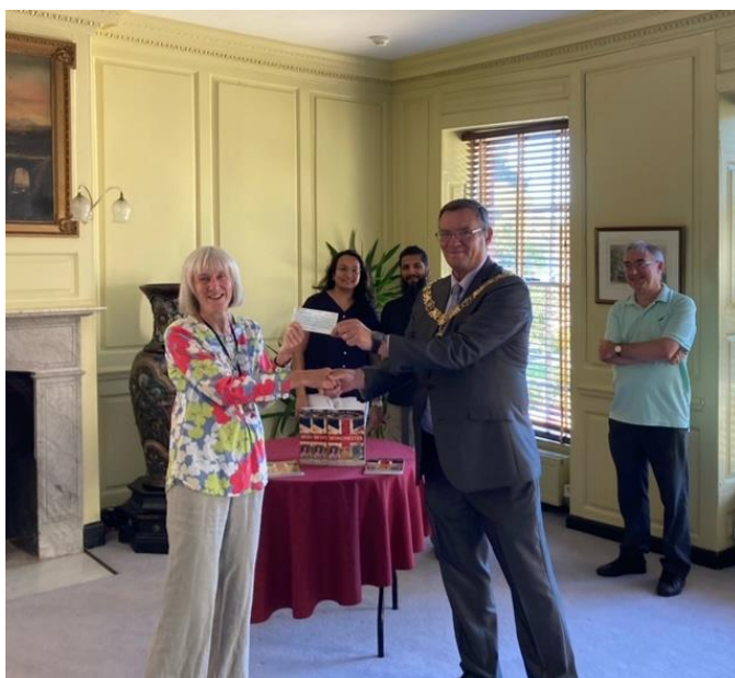
The photo shows Clare presenting the cheque to the Mayor in Abbey House. Looking on are some visitors to Winchester who were taking part in a tour of Abbey House organised by the Winchester Tourist Guides.

A few copies of the book are still available for sale in Winchester’s Visitor Information Centre, The Broadway, for £9.99.