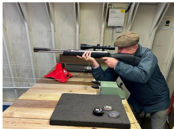
Mexican standoff at the Itchen Valley Shooting Club