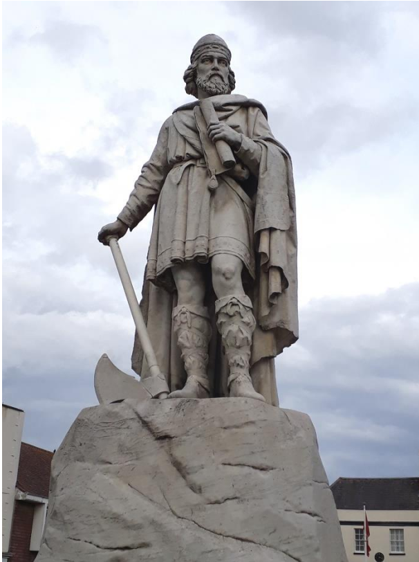
King Alfred the Great statue at Wantage