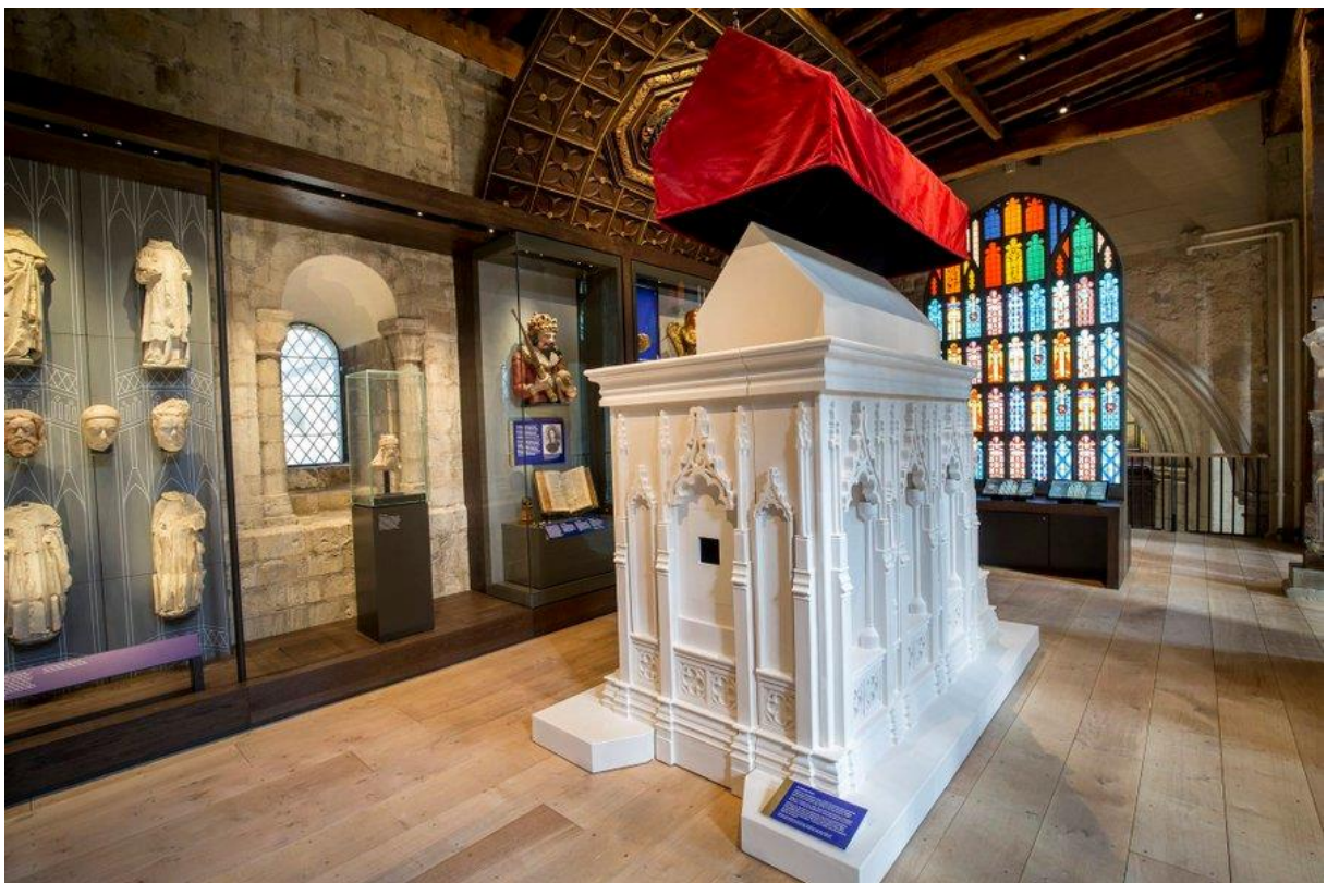
Replica of St Swithun's stone shrine from the Kings and Scribes exhibition, Winchester Cathedral

In 1093 as the new Norman Cathedral was being built, Swithun's bones were brought into the Cathedral and placed near the High Altar. Then in 1476, following the construction of a new shrine built in the Retrochoir, Swithun's relics were paraded through the city before being placed in the new position. In less than a hundred years, after the construction of the new shrine, it was demolished. In the 1530s Henry VIII set about dissolving the monasteries and as part of this process, Henry's chief minister, Thomas Cromwell set up a commission to oversee the destruction of shrines and adornments. On 20 th September 1538 the commissioners arrived at Winchester Cathedral. The official report written by the commissioner in charge, Thomas Wriothesley, was sent to Thomas Cromwell. The report noted that at about three o'clock in the morning "we made an end of the shrine here at Winchester". They failed to find any gold, precious stones or rings, but found a substantial quantity of silver amounting to 2,000 marks (approx. £1.4 million today). They concluded that it had been their intention to sweep away all the bones, or relics, but none were found. A legend says that the monks hid the bones before King Henry's commissioners arrived, so perhaps they were buried within the Cathedral or the Cathedral precincts in a safe place. To date they have not been found.