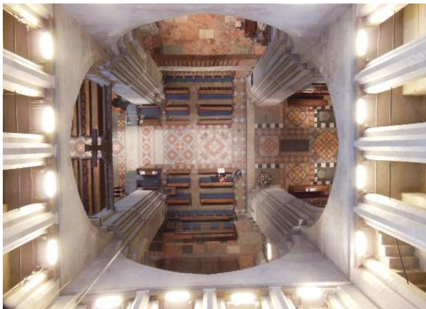
Fig: 1 Tower columns pictured from above