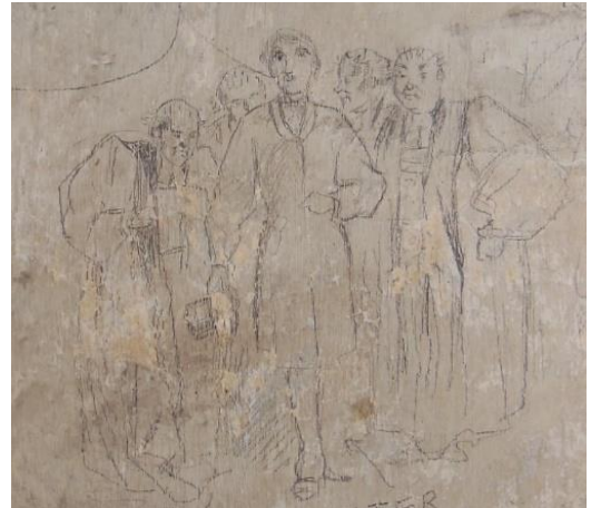
Fig: 4 Pencil or charcoal drawing in bell tower thought to represent family of the infamous Master North