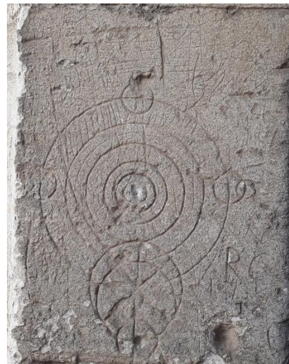
Fig: 2 Beaufort Tower – Opposite Porter’s Lodge astro- nomical graffiti