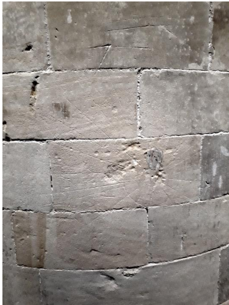
Fig 3: Nave column, north side – possible celestial influences